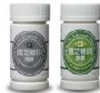
PSP Essence | PSP Regular

Coriolus Versicolor PSP 雲芝糖肽膠囊 (保健裝/精華裝) Double Blind Clinical Test done and proven effective. 1982 invented and patented.